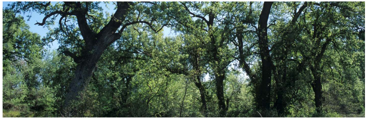
Riparian Forest along the Sacramento River.