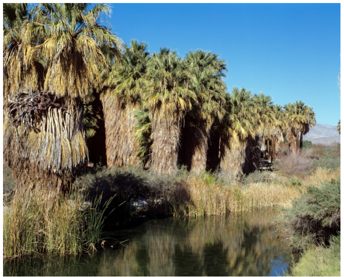
Palm trees surround a spring fed pool in the Coachella Valley Preserve.