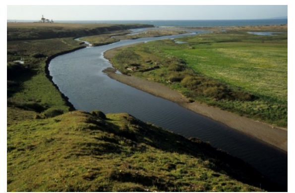
Lower Garcia River as it enters the ocean.

1. Mapping Errors. Land use changes may have occurred since the source datasets were mapped. The database was