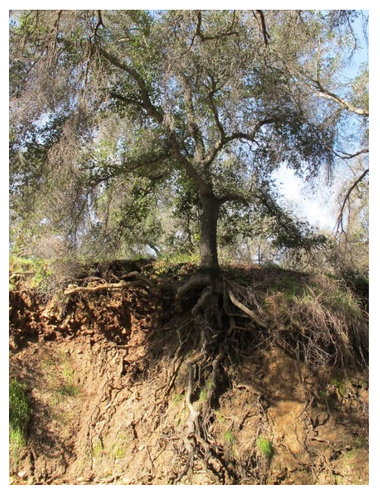
The root system of an oak tree exposed by river erosion.

The mapping methods used by Howard and Merrifield (2010) is one of several approaches used to map GDEs. Other researchers have used the following approaches: