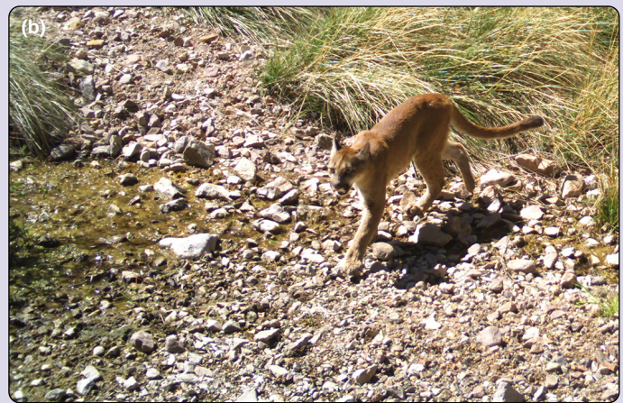
Figure 5. In the Sky Islands region of Mexico and the US, citizen scientists (a) monitor springs seasonally using established protocols and a centralized database, supplemented with remote cameras to document (b) wildlife use of springs.

these springs can be identified as potentially stable refugia, especially if other lines of evidence suggest hydrologic resistance to climate change (Figure 4; WebTable 2). Monitoring after disturbances, such as wildfires, also may reveal whether some springs function as fire refugia (WebPanel 1; WebFigure 1).