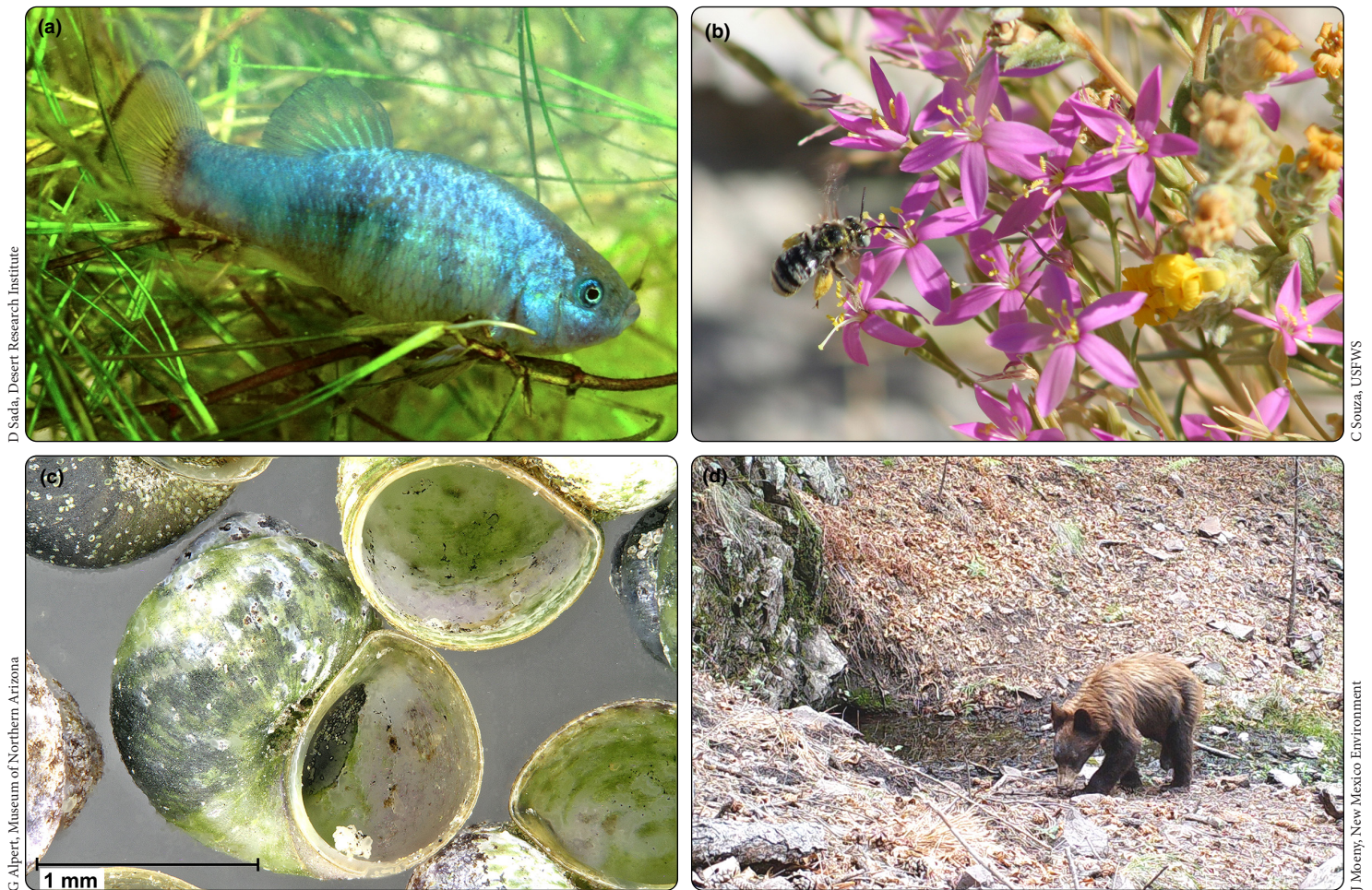
Figure 2. Springs are hotspots of biodiversity, supporting (a) groundwater-dependent endemic fish (eg Salt Creek pupfish, Cyprinodon salinus ); (b) plants (eg spring-loving centaury, Zeltnera namophila ); and (c) invertebrates (eg New Mexico hot spring snail, Pyrgulopsis thermalis ). Springs are also critically important water sources for terrestrial animals in water-limited landscapes, including (d) the American black bear ( Ursus americanus ).

and from ephemeral to dry. Over time, springs and other surface expressions of groundwater became the primary remaining sources of habitat for the evolutionary lineages of formerly widespread aquatic and wetland taxa (Perez et al. 2005; Box et al. 2008; Murphy et al. 2012).